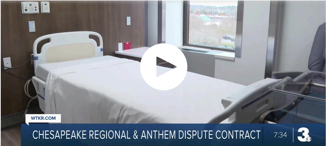
Chesapeake Regional, Anthem in insurance dispute